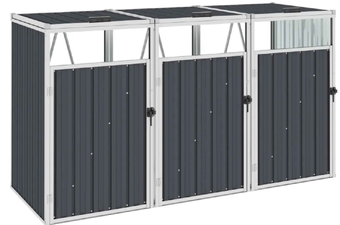
EXAMPLE OF TYPICAL BIN STORE INDICATIVE ONLY, FINAL COLOUR FINISH SUBJECT TO COMPLIANCE AGREEMENT